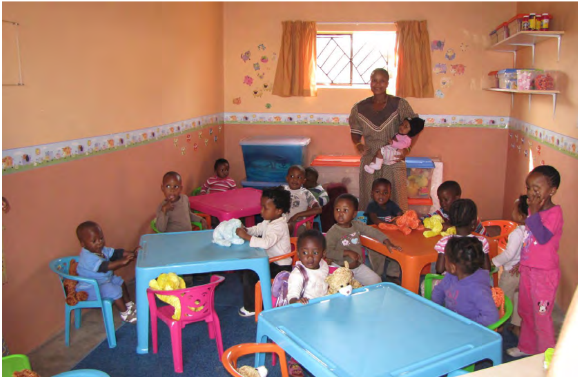
The appreciation of children and their teachers