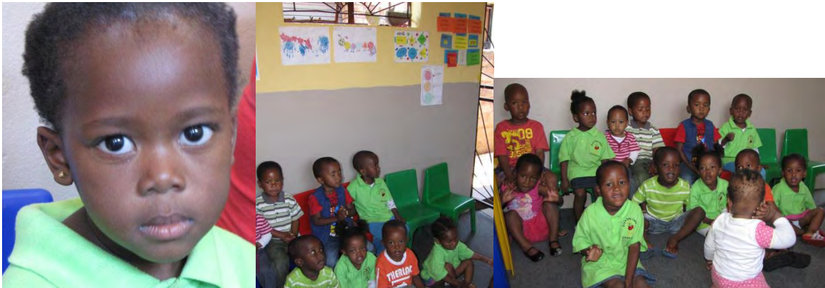
The children at their school