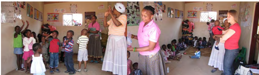
A song from the children