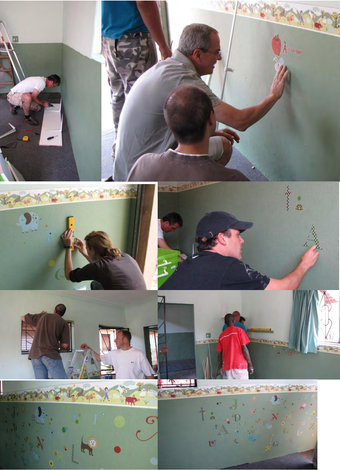
The Chartwell team re-vamping at Evy's Pre-School on 18 October