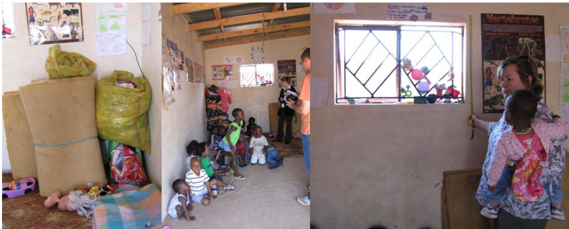
No storage space, broken toys